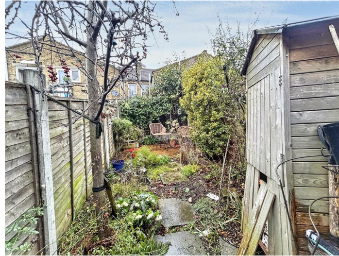
rear garden comprising of tiled area with remainder laid to lawn - shrub borders.